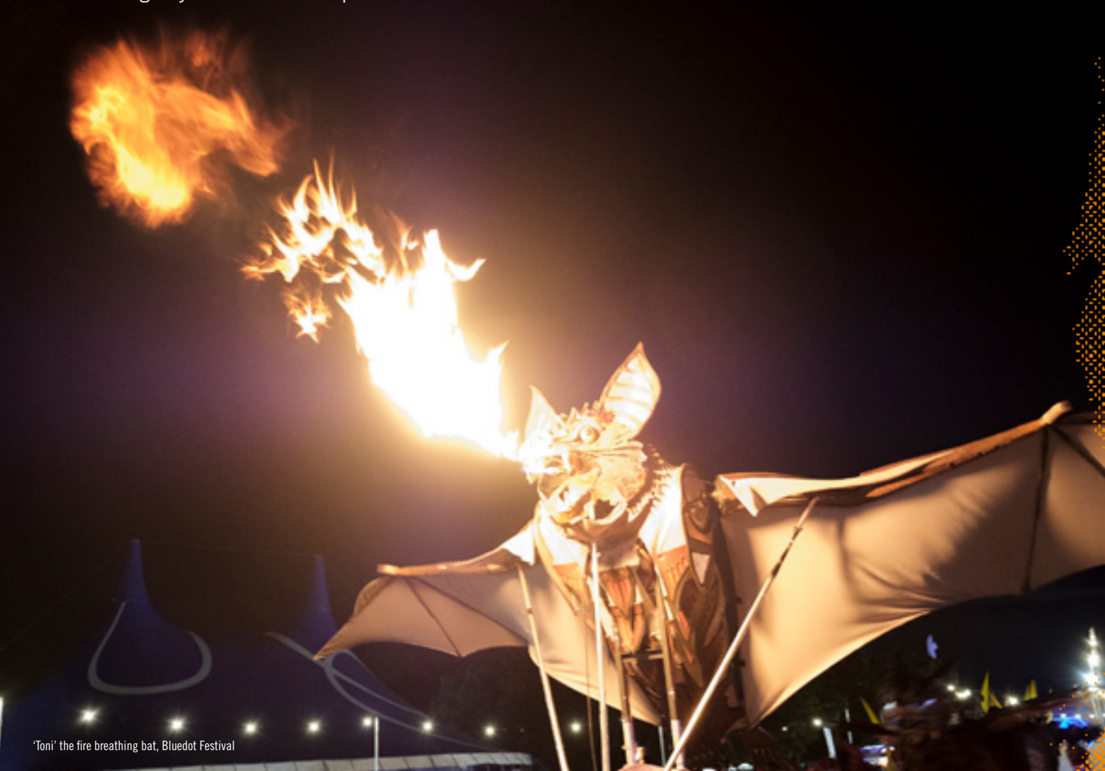
"Toni" the fire breathing bat, Bluedot Festival

Crowds attending the Blue Dot Festival at Jodrell Bank in July 2018 were amongst the first to meet the raucous menagerie of puppets and costumed-characters, accompanied by an illuminated cabal of cyborg percussionists. Our loveable characters and costumes have now been seen by audiences of tens of thousands at over 50 events since.