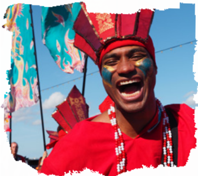
All smiles at Festival of the Sky, Cleethorpes