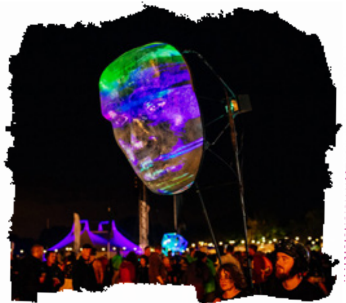
'Efe' at Bluedot Festival