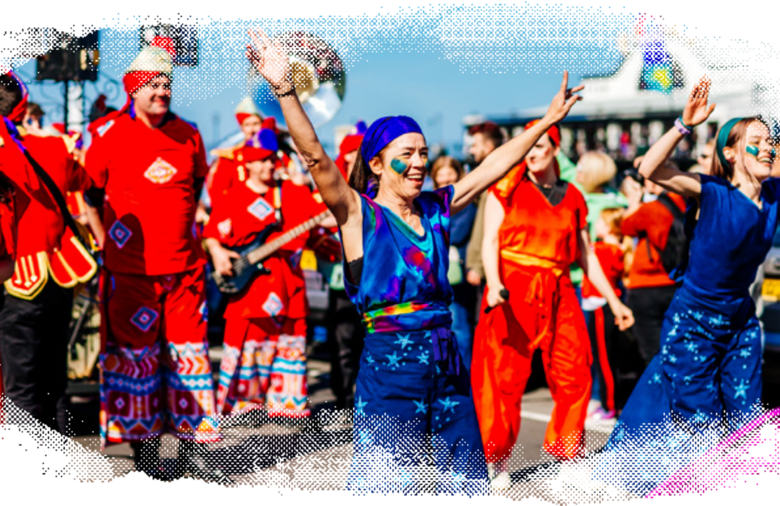
'Funk It Up' — good vibes on the street at Festival of the Sky, Cleethorpes, 2019