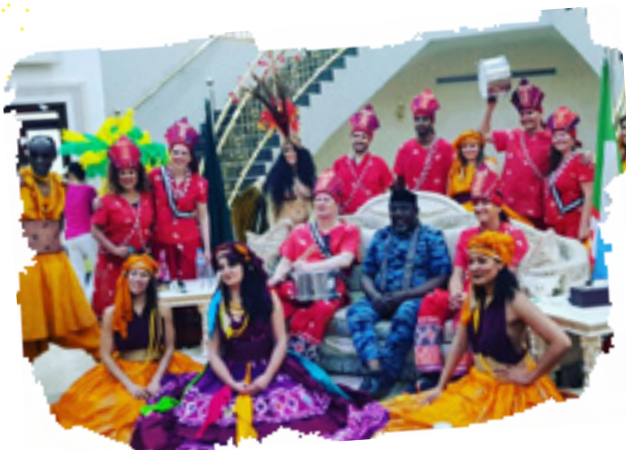
Global Grooves performing in Imo State Carnival, Nigeria, 2018