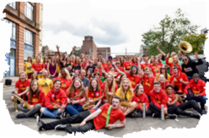
'Dodgy Carpet Carnival' youth collaboration with SambaYaBamba Youth Street Band in Glasgow, 2018