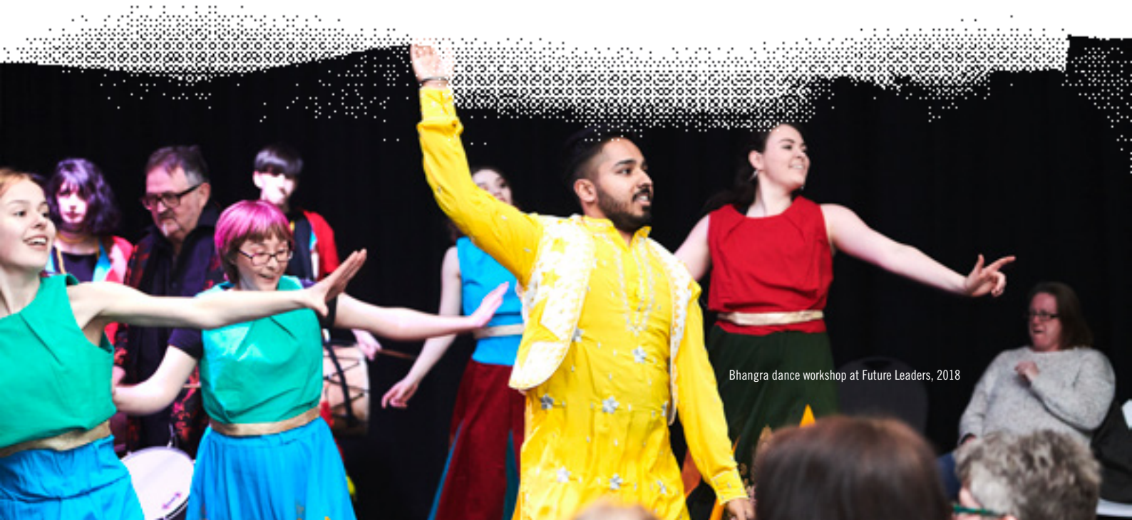
Bhangra dance workshop at Future Leaders, 2018