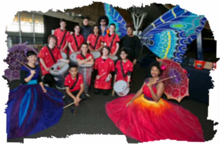
Future Leaders perform at British Airways Fun Run event