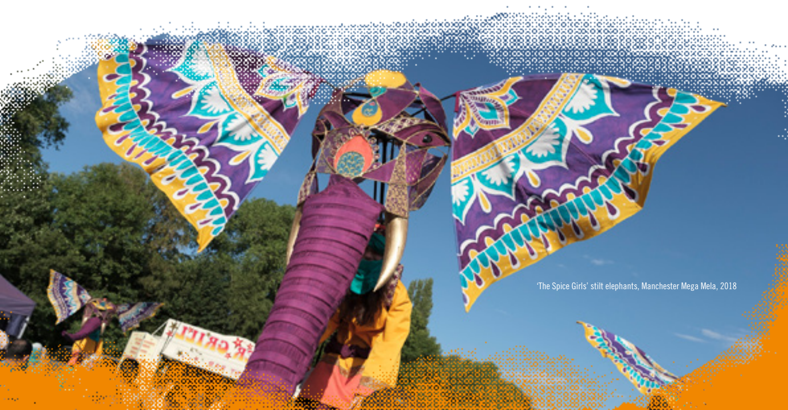
'The Spice Girls' stilt elephants, Manchester Mega Mela, 2018