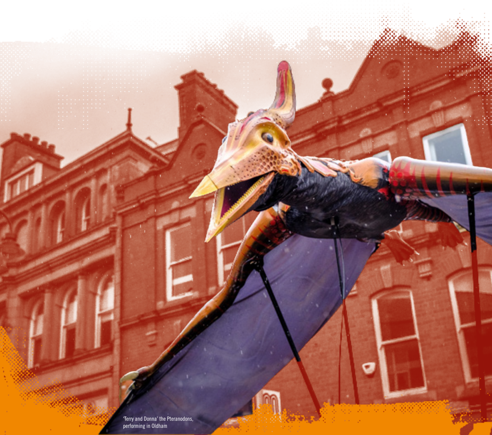
"Terry and Donna" the Pteranodons, performing in Oldham