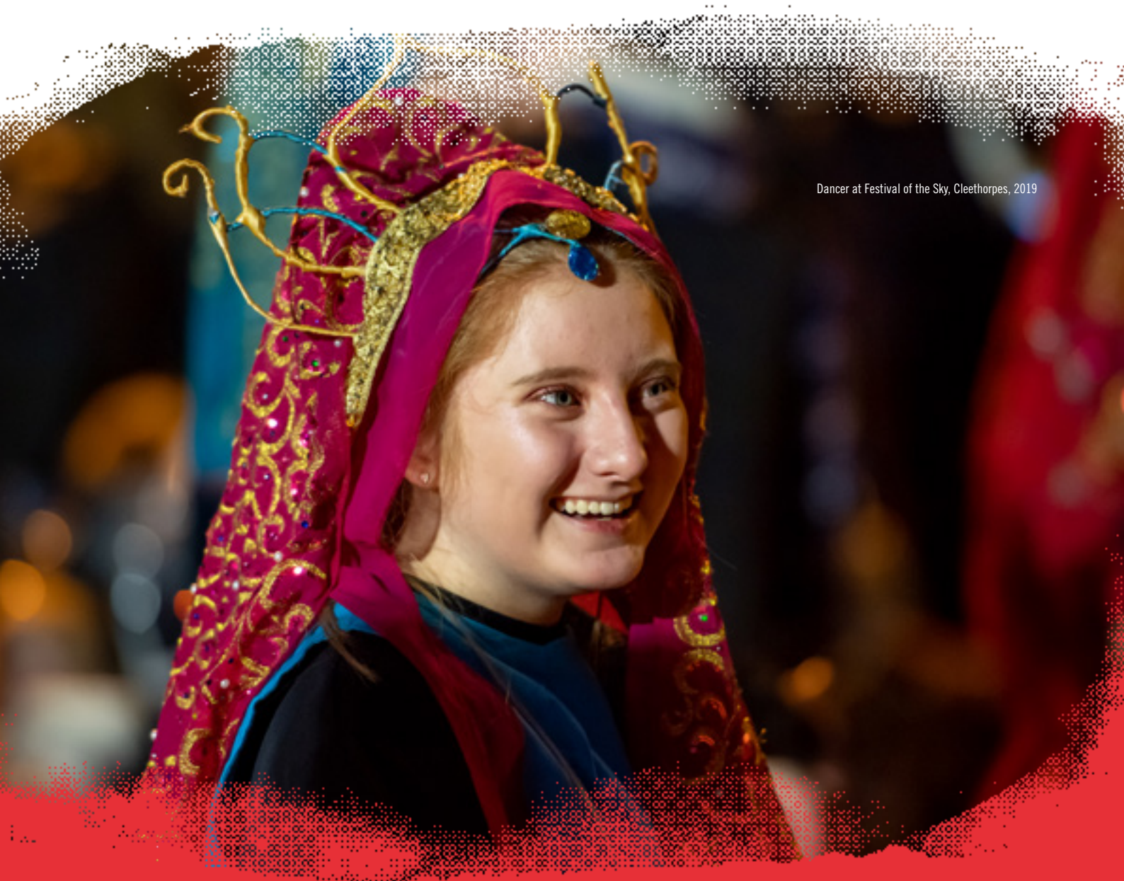
Dancer at Festival of the Sky, Cleethorpes, 2019