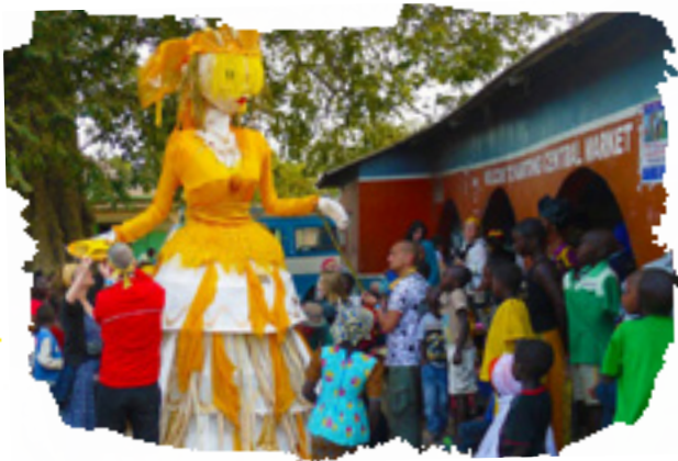
Puppet making in The Gambia