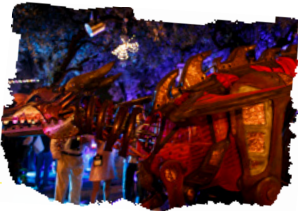
'Bessemer' the fire-breathing dragon, performing in Italy, 2019