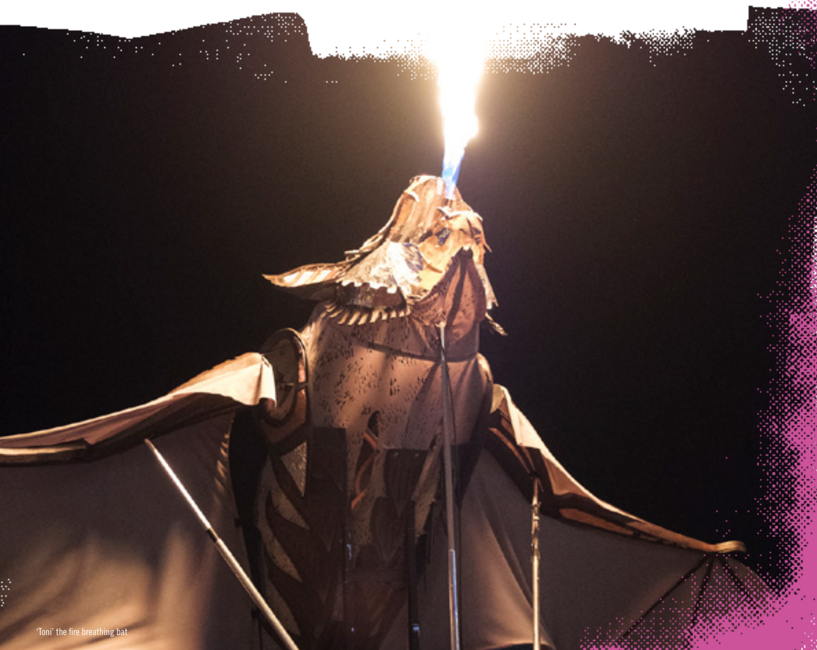
'Toni' the fire breathing bat

Sadly, many of these were lost in the 2018 fire at Ray Mill, but following generous support from Arts Council England and crowdfunding from our incredible supporters, we launched Project Phoenix, an opportunity to bring to life brand new creations. This project brought in master puppet designers, giving our in-house artists a chance to shadow experts in their field.