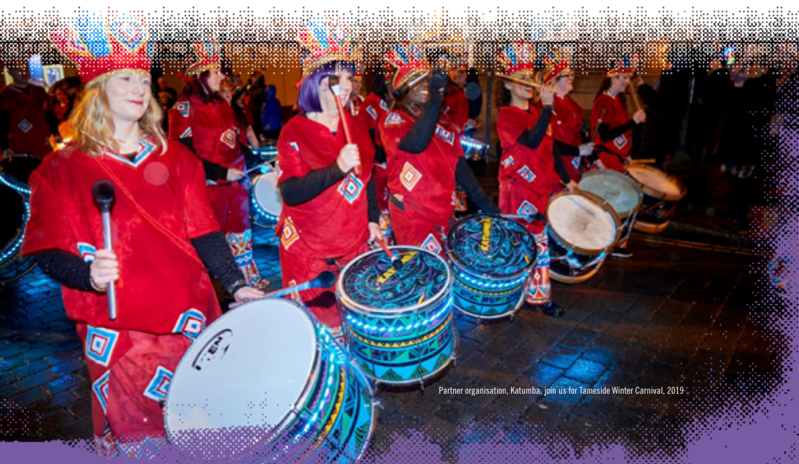
Partner organisation, Katumba, join us for Tameside Winter Carnival, 2019

a weekly visual arts group based at The Vale that works to make art and crafting accessible and fun.