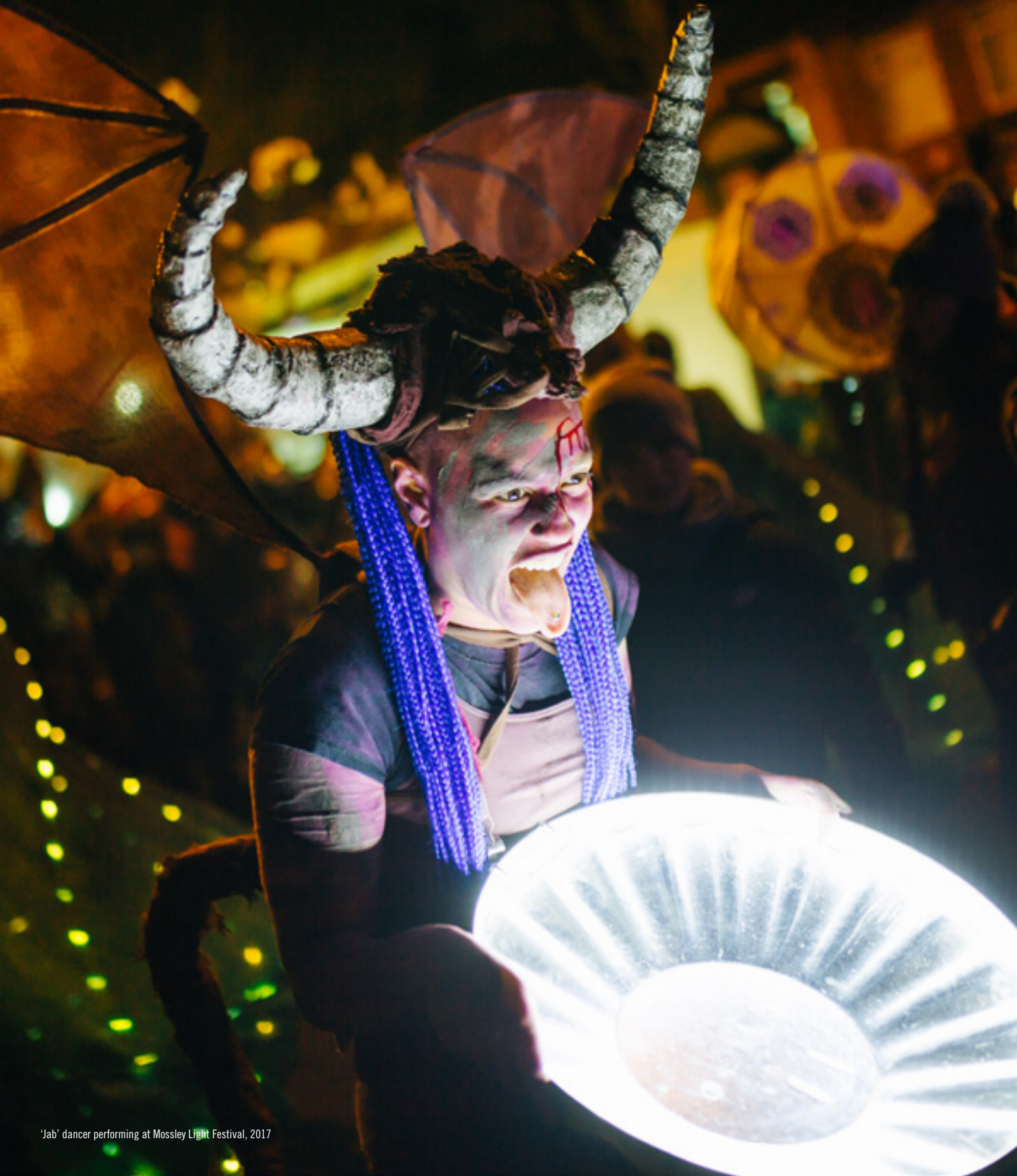
'Jab' dancer performing at Mossley Light Festival, 2017