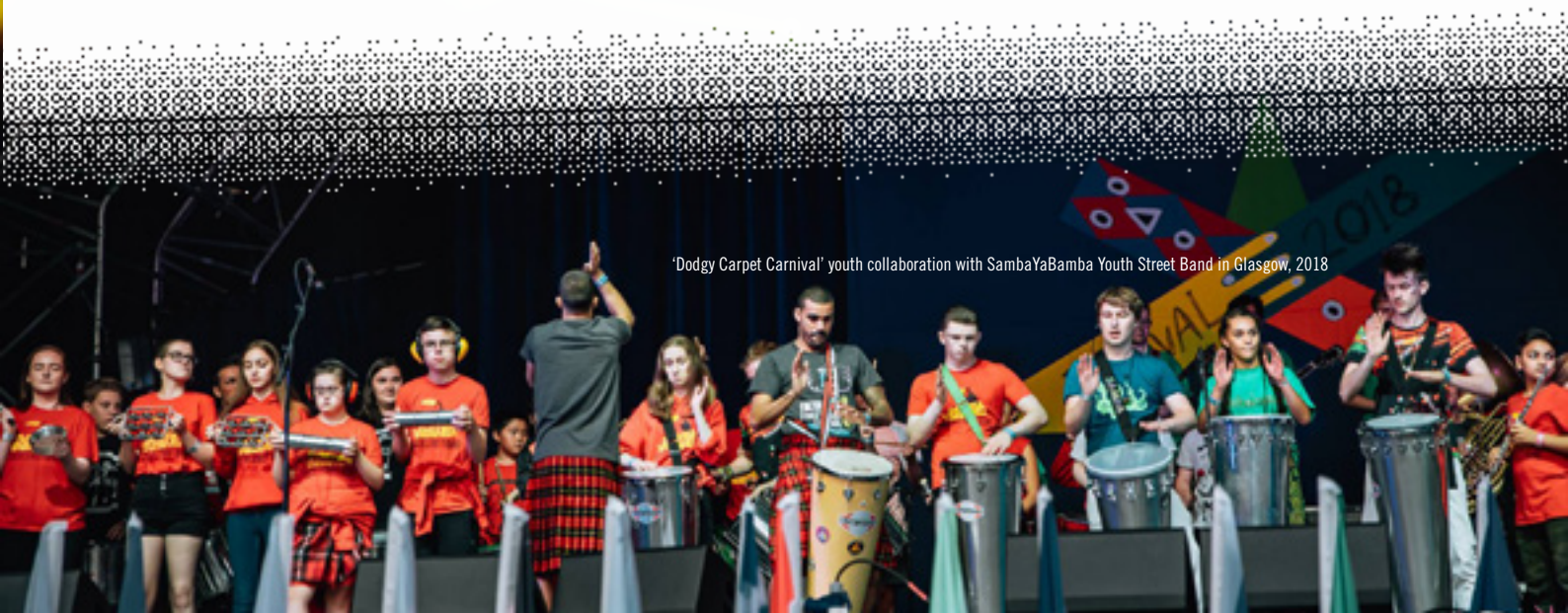
'Dodgy Carpet Carnival' youth collaboration with SambaYaBamba Youth Street Band in Glasgow, 2018

Throughout Global Grooves' history, we have worked closely with the British Airways 'Community and Conservation' programme. In our most recent appearances, we have handed over the reins to our Future Leaders for them to entertain and the community fun-runners and celebrity guests in attendance.