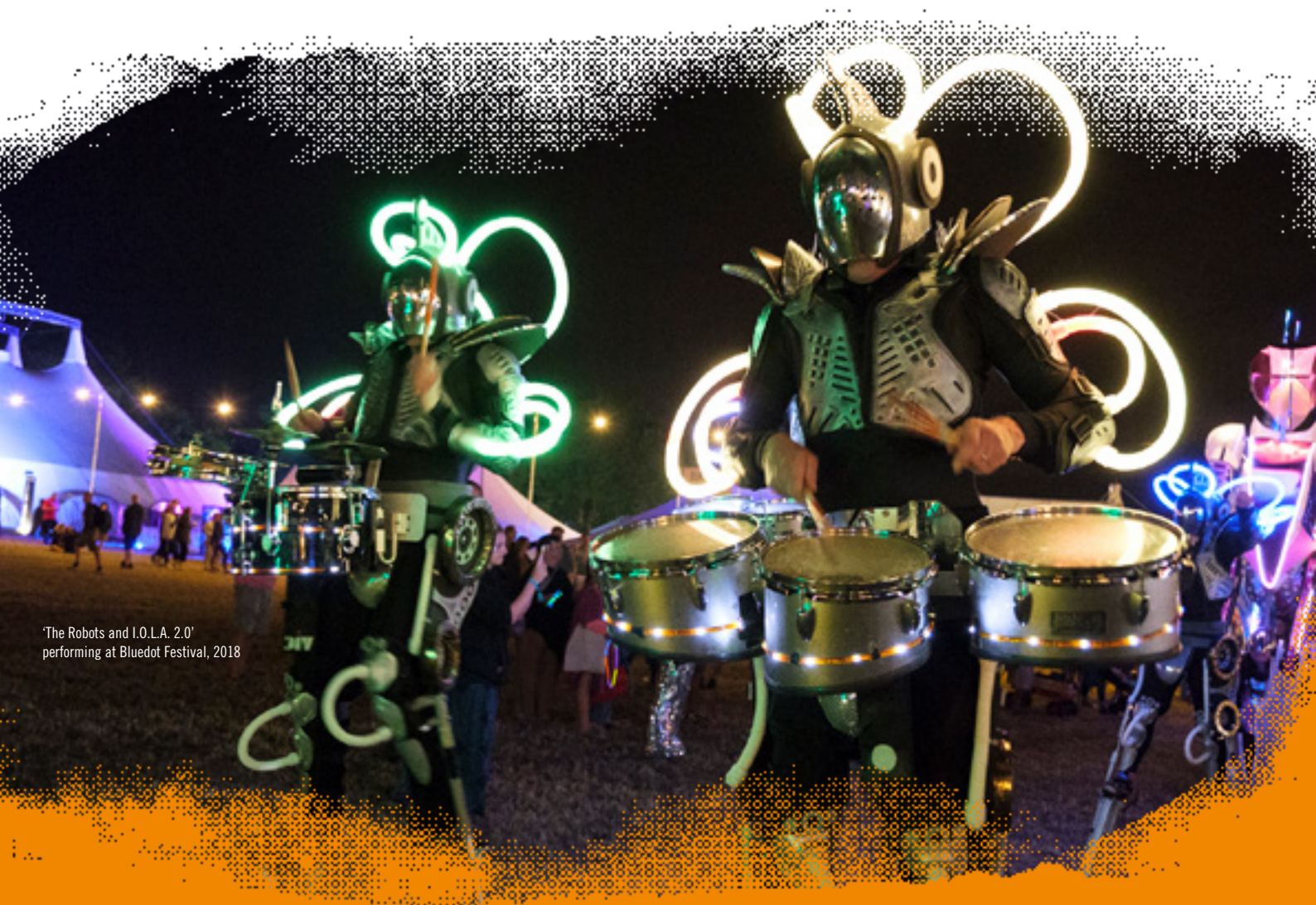
'The Robots and I.O.L.A. 2.0' performing at Bluedot Festival, 2018